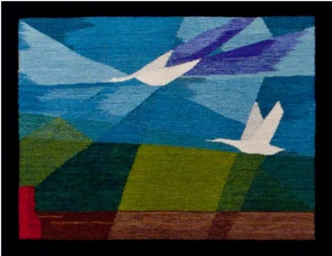
Exhibit of Original Tapestries.....

Handwoven tapestries by Tapestry Artists of Las Arañas and Las Tejedoras Albuquerque Little Theatre, 224 San Pasquale SW, Albuquerque Upstairs, In the Cantina Gallery August 26 to October 30, 2016 Artwork May Be Purchased at the Theatre Box Office on "Little Shop of Horrors" Performance Days Call or visit the ALT website for dates and times and to purchase tickets