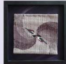
SongBird/Crane: Sharon Van de Velde