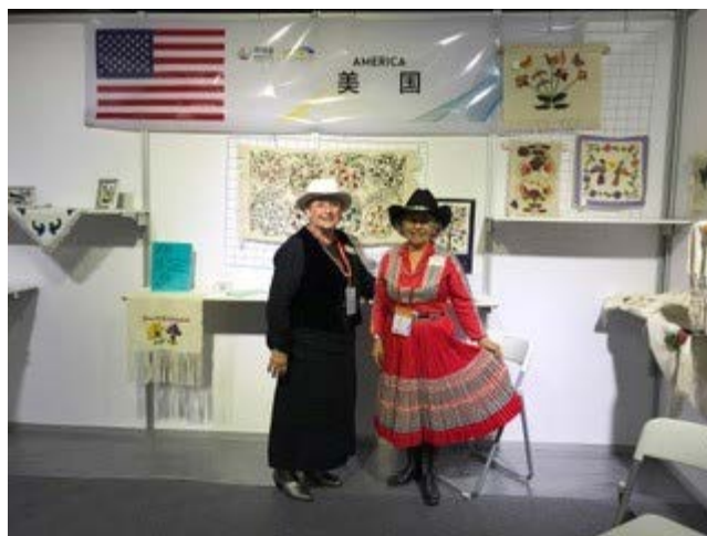
Two US Representatives at the 2017 China (Guizhou) International Folk Culture & Tourism Products Expo